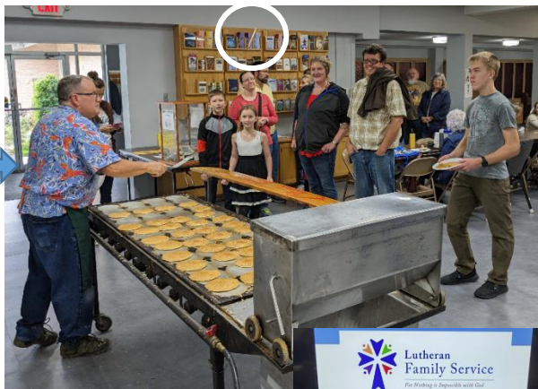
Pancakes were flying (see the circle) at Zion Preschool's pancake breakfast!